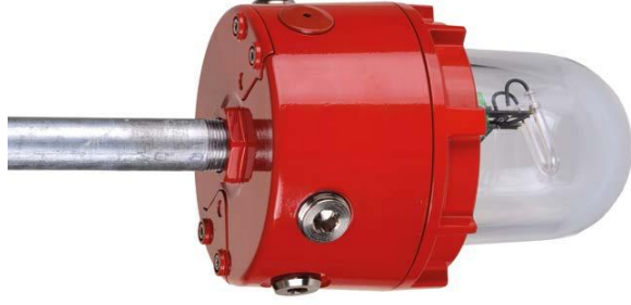
D1xB2XH1/XH2 - pendant mounting