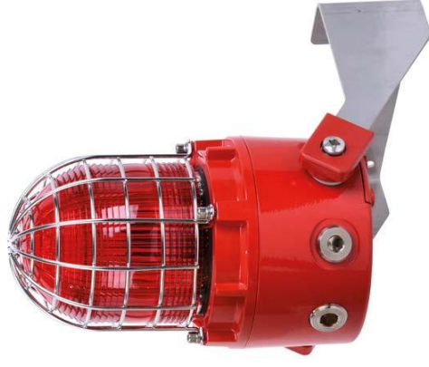
D1xB2 beacons- bracket mounting allows beacon to be rotated in any orientation

The globally approved D1xB2 family from E2S offer the most comprehensive range of solutions for UL1638 signaling in Class I/II Div 1 or Zone 1/20 explosion proof applications..