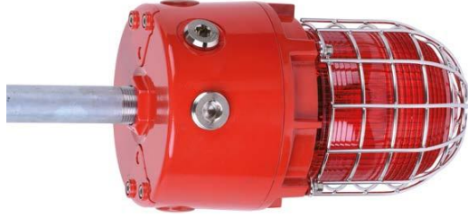
D1xB2 beacons- pendant mounting