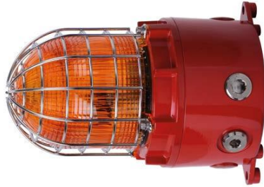
D1xB2 beacons- surface mounting