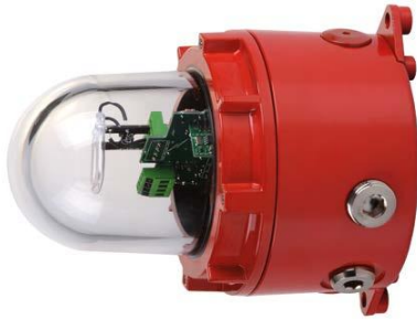
D1xB2XH1/XH2 - surface mounting