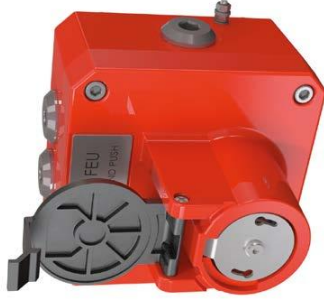
GNExCP7-PT / GNExCP7-PM