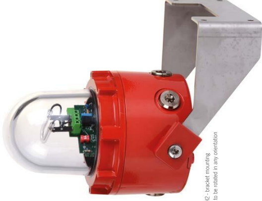
D1xB2XH1/XH2 - bracket mounting allows beacon to be rotated in any orientation