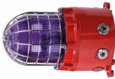
D1xB2 beacons- surface mounting